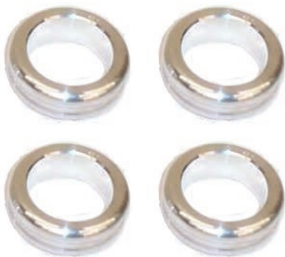
73-12736 Front and Rear Spring Spacer (4ea) 80P